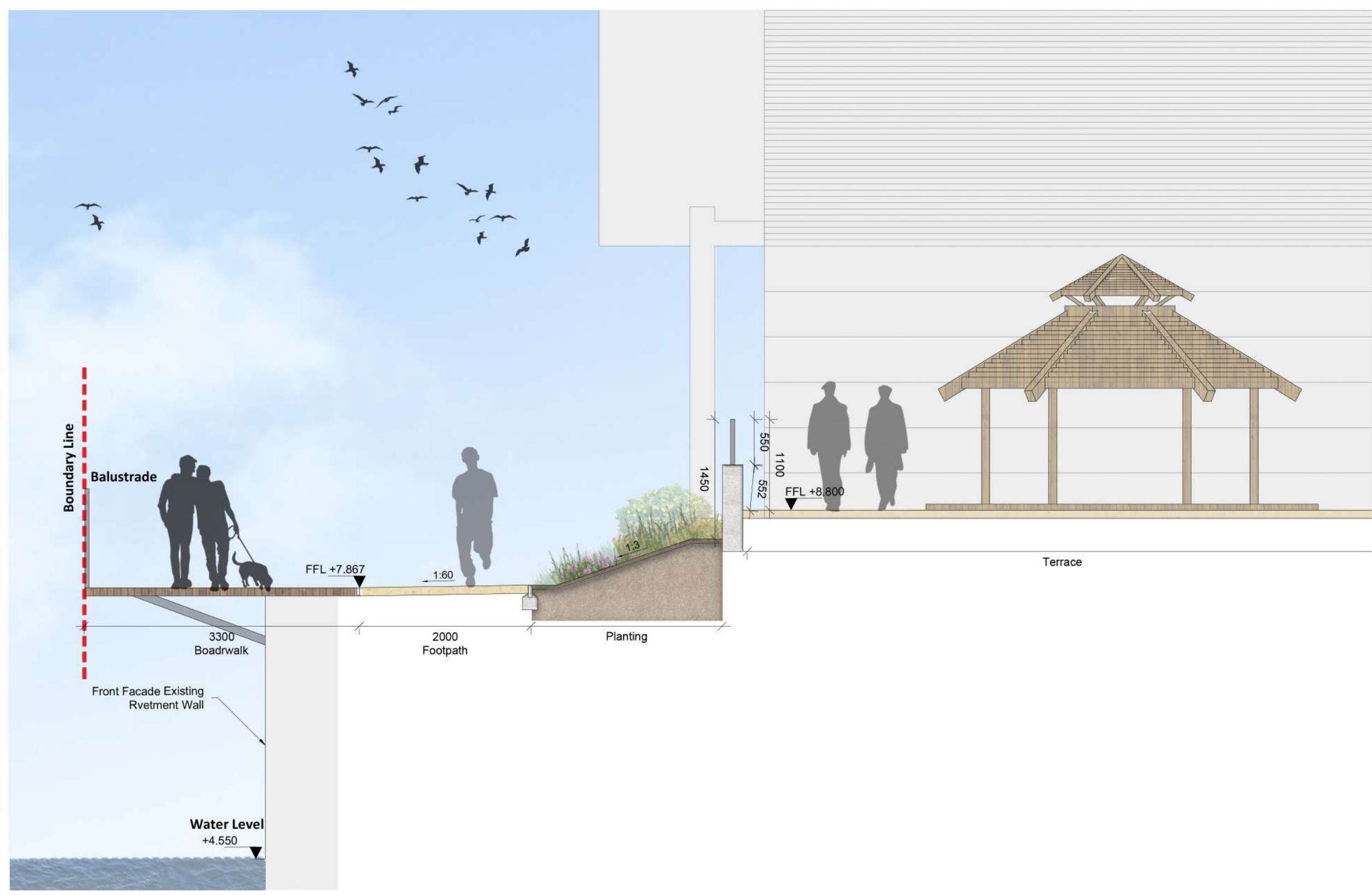
2 Section 4 501 scale 1:50 @A1