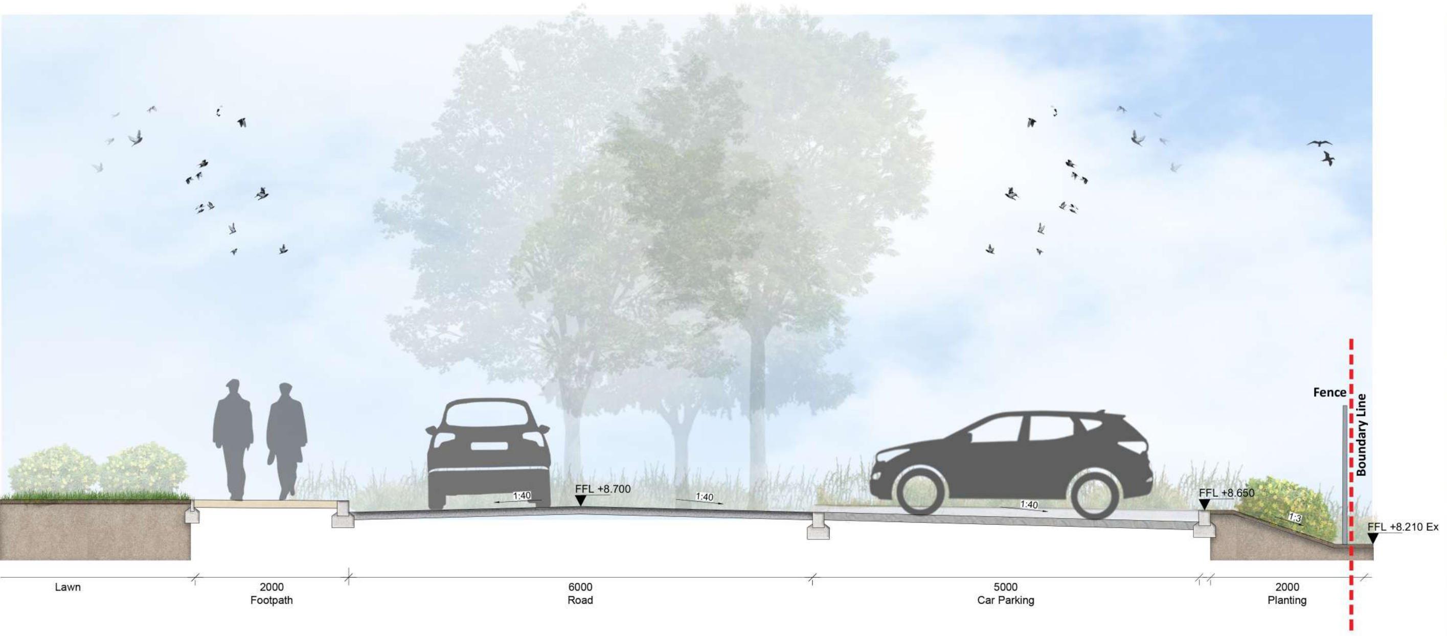
1 Section 3 501 scale 1:50 @A1