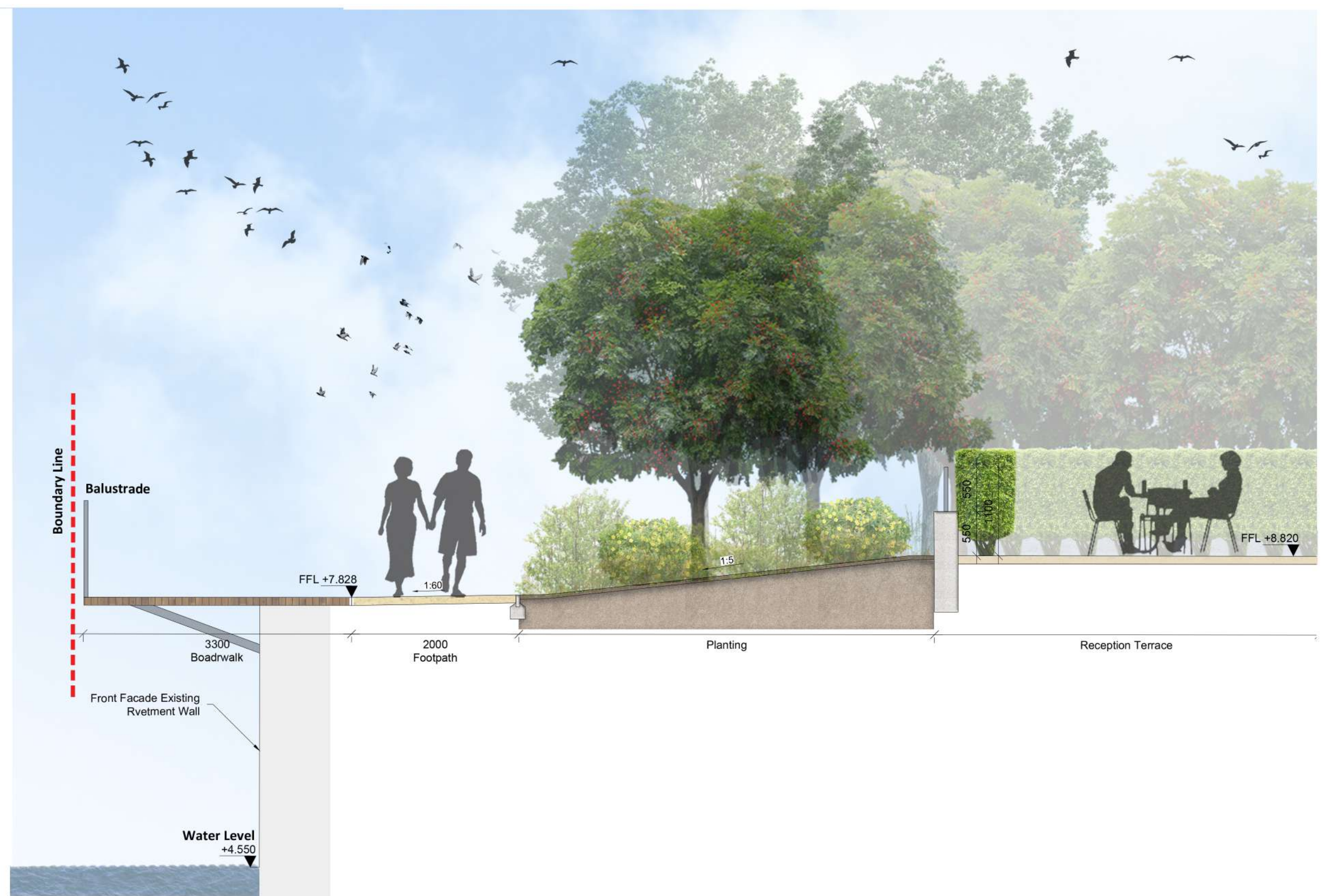
3 Section 6 501 scale 1:50 @A1