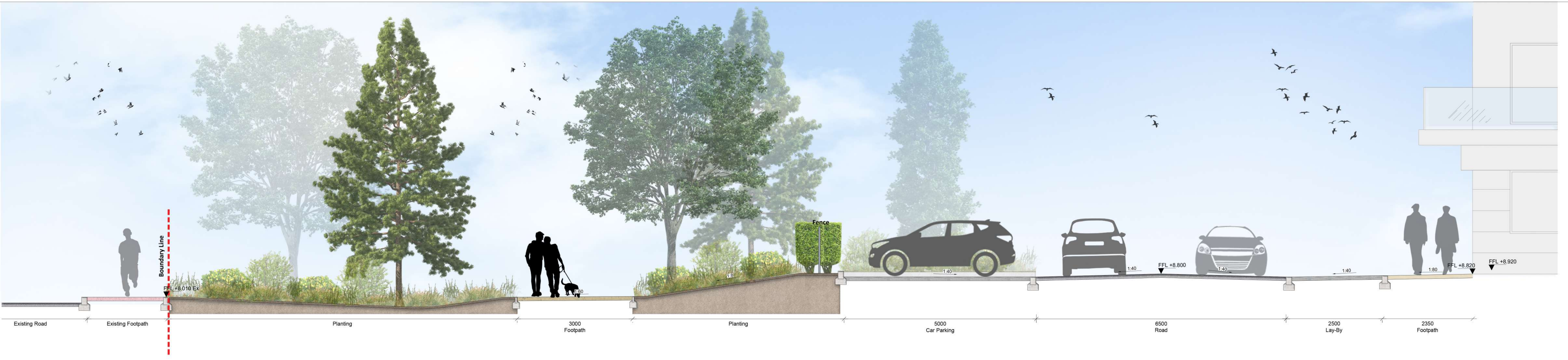
1 Section 1 500 scale 1:50 @A1