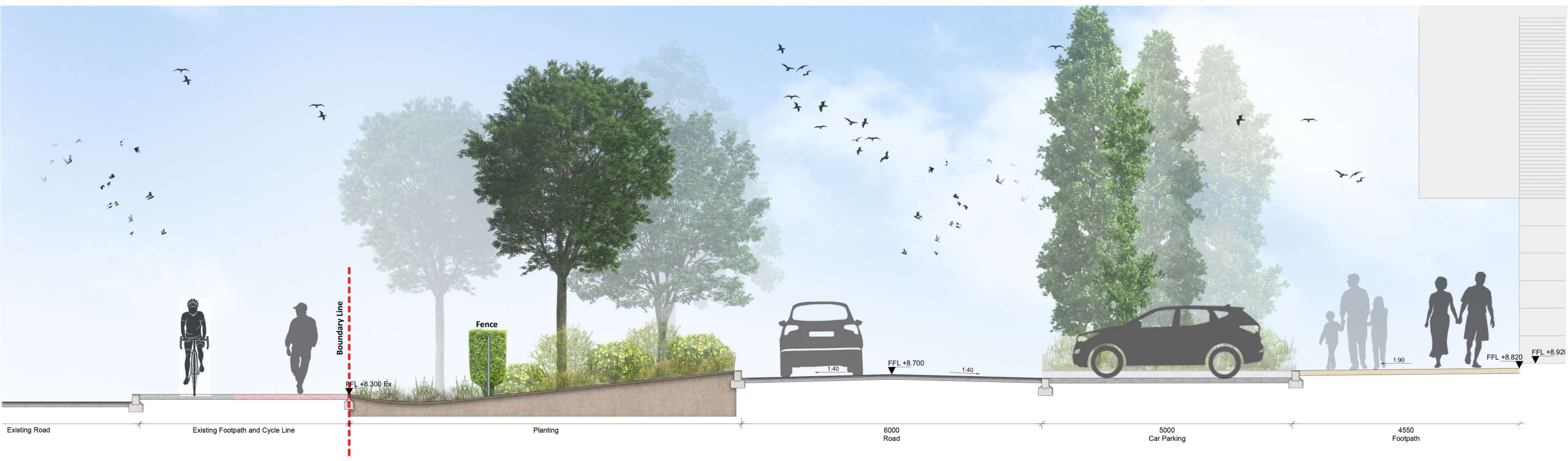
2 Section 2 500 scale 1:50 @A1