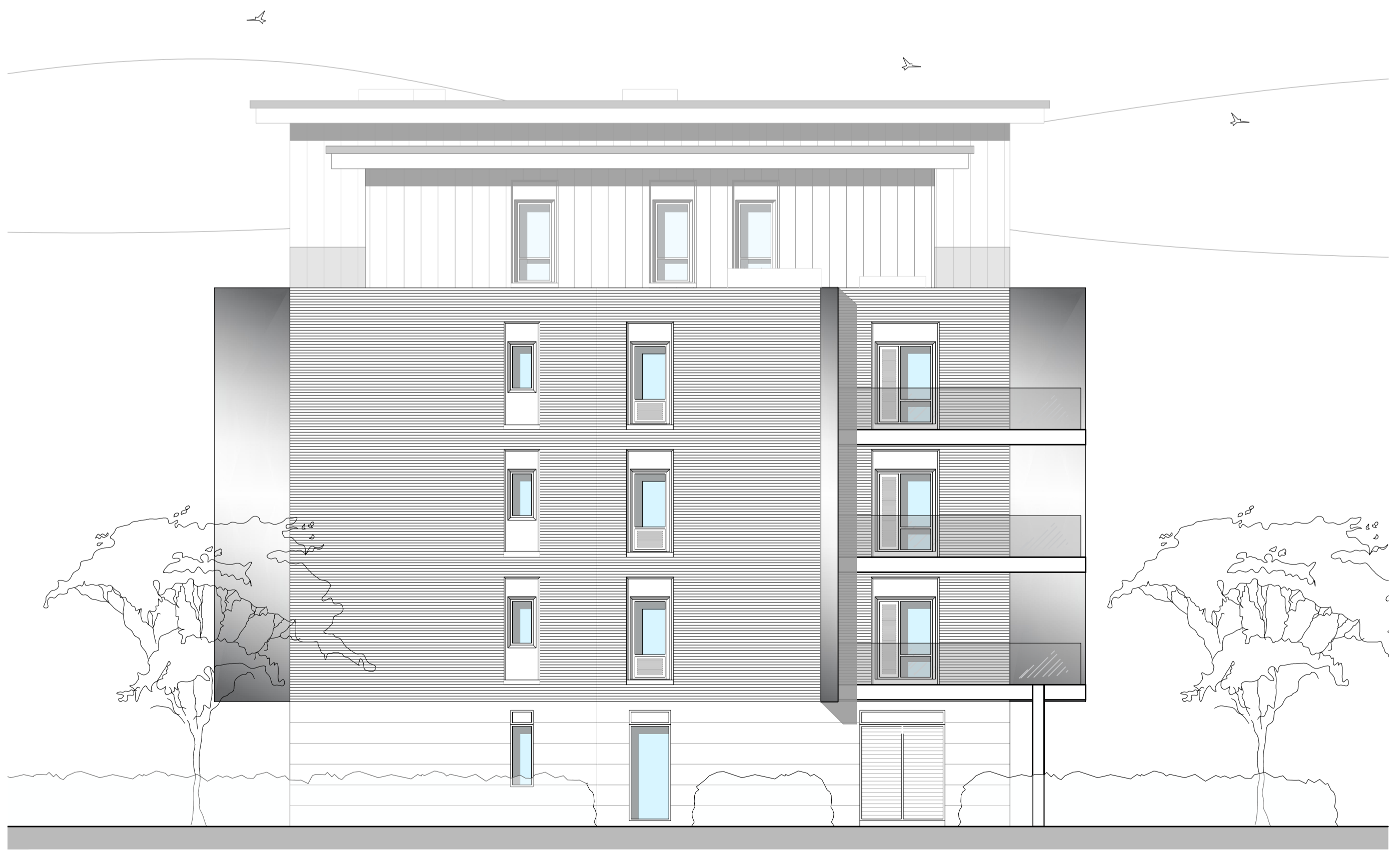
REAR ELEVATION 'ELEVATION H'