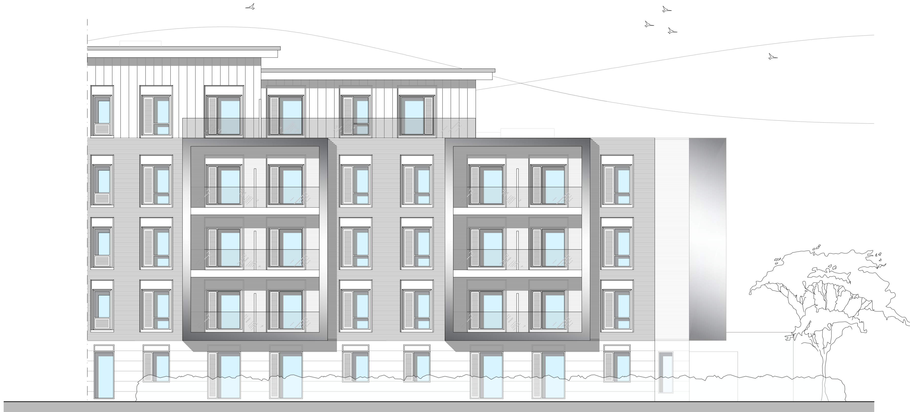
REAR ELEVATION 'ELEVATION G'