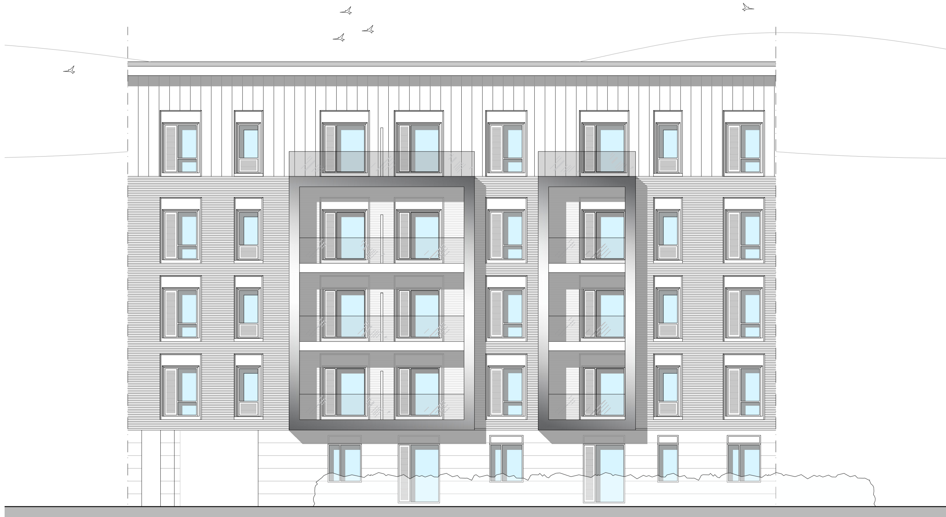
REAR ELEVATION 'ELEVATION F'