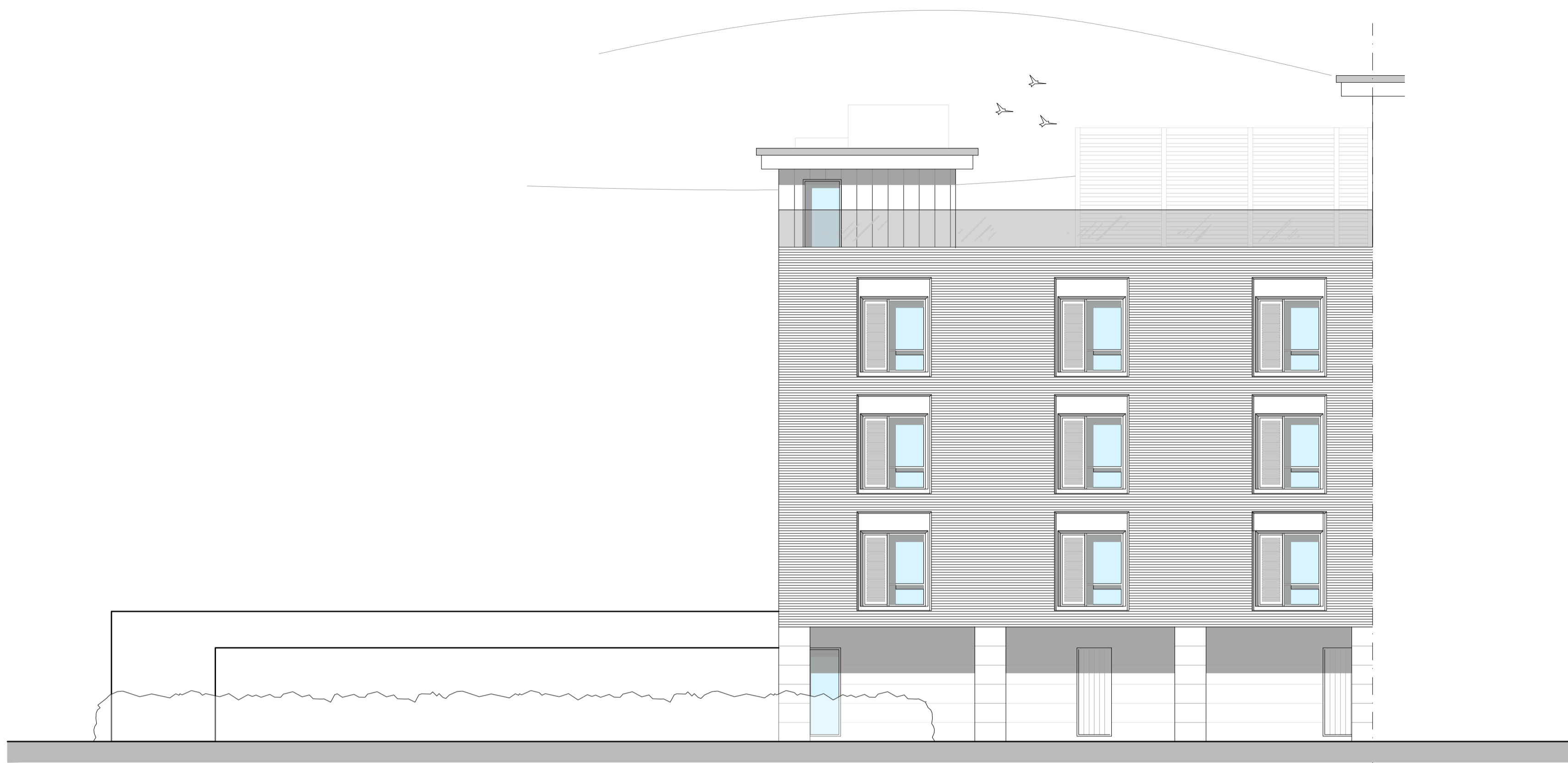
REAR ELEVATION 'ELEVATION E'