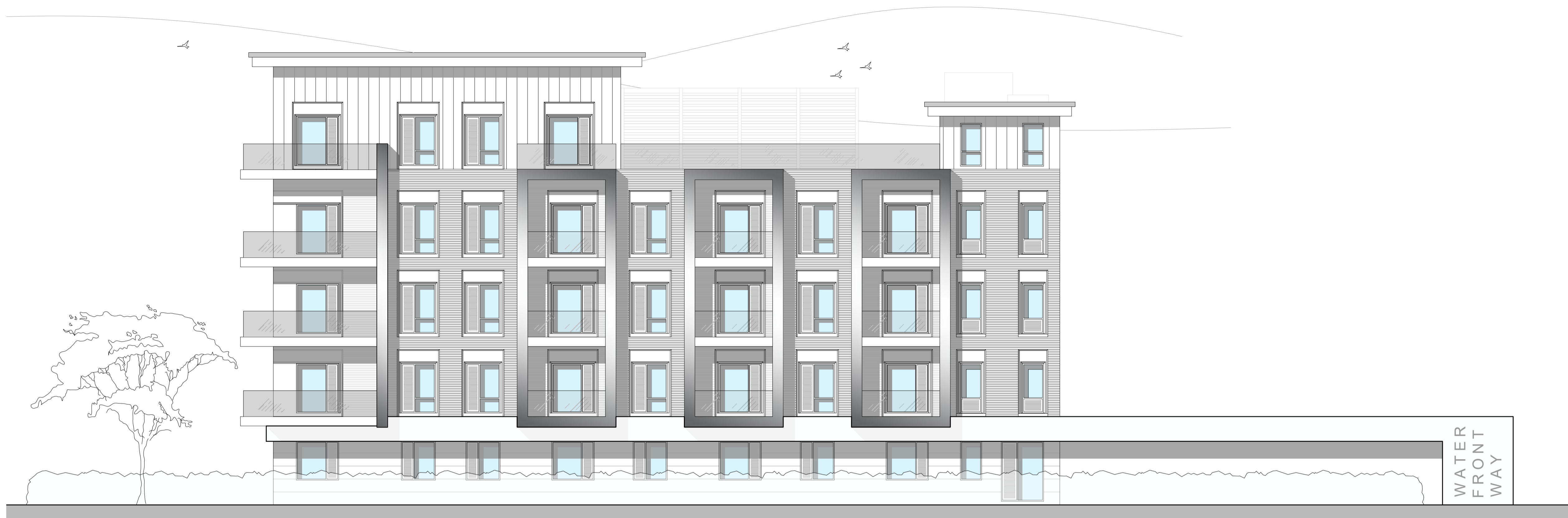
FRONT ELEVATION (WATER FRONT) 'ELEVATION C'