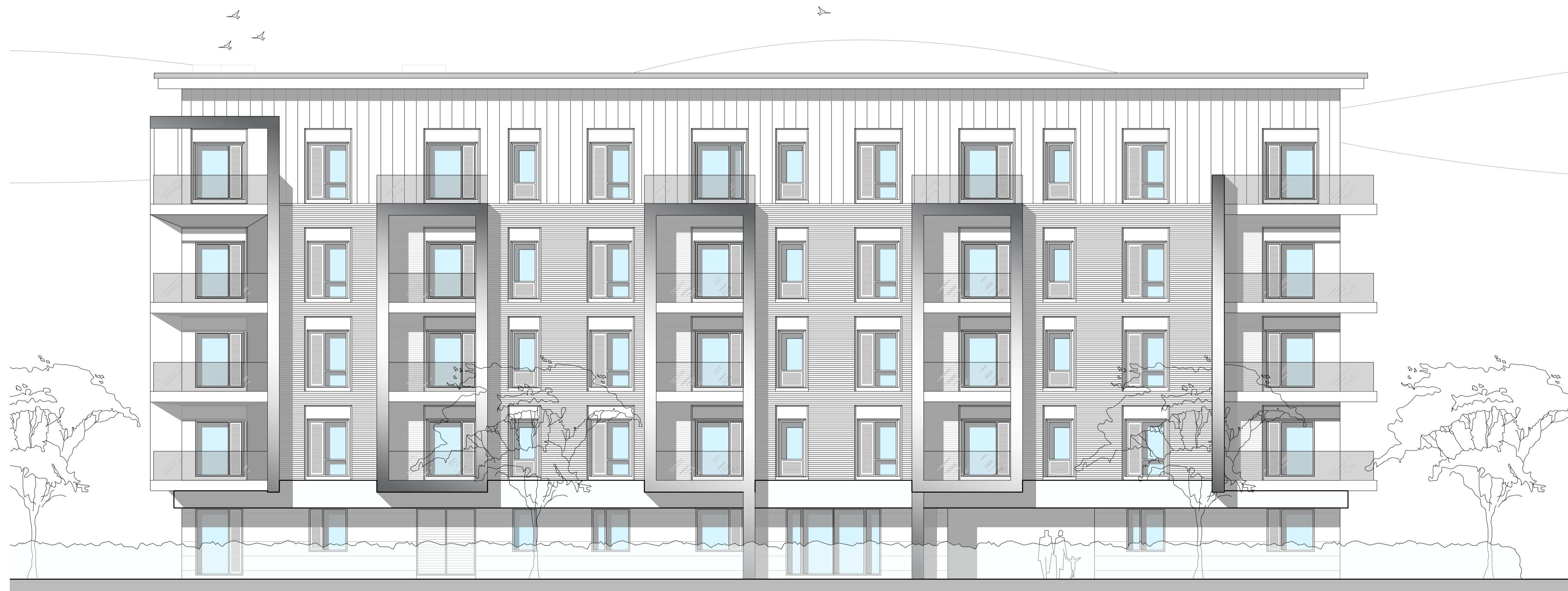
FRONT ELEVATION (FRONT ENTRANCE) 'ELEVATION B'