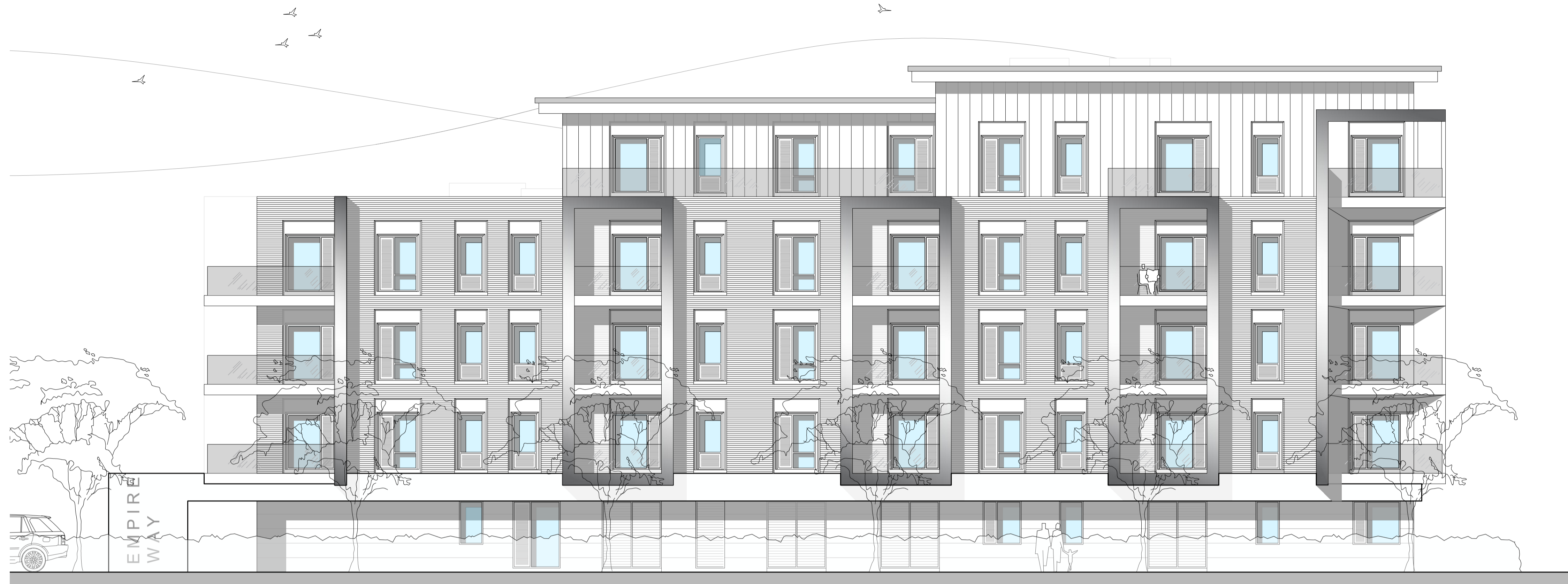
FRONT ELEVATION (EMPIRE WAY) 'ELEVATION A'