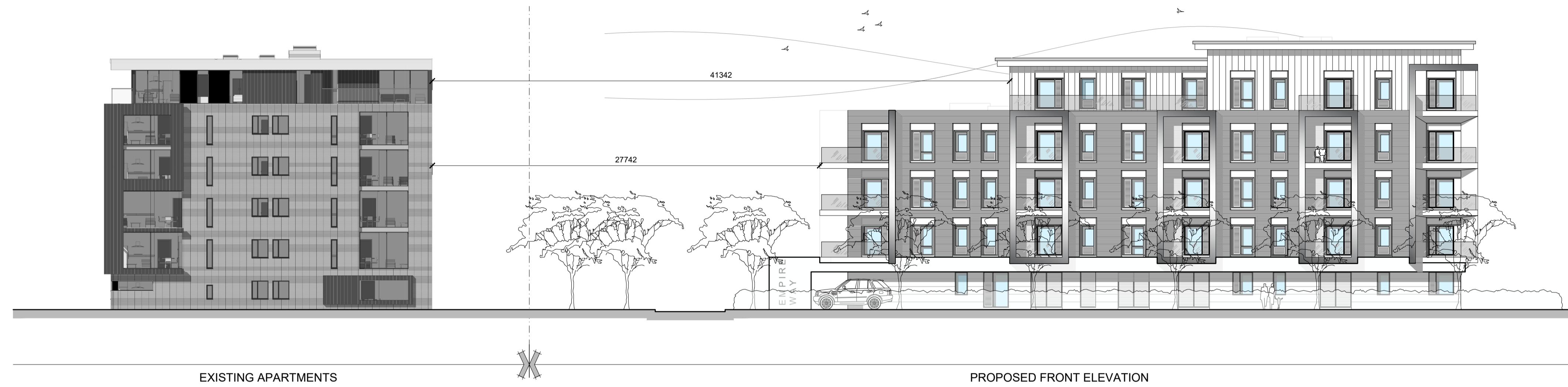
PROPOSED SITE SECTION EMPIRE WAY - (1:200)